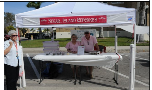
Your Editor with neighbors who own the Sugar Island Cupcakes and Baked Occasions Wedding Cakes.

Remember the Farmer's Market on Saturday mornings between Herald Court and the Old Courthouse.