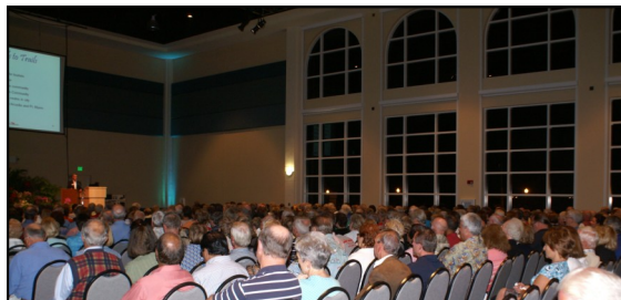
We enjoyed the beautiful, new Charlotte Harbor Event and Conference Center with enough seating for all!